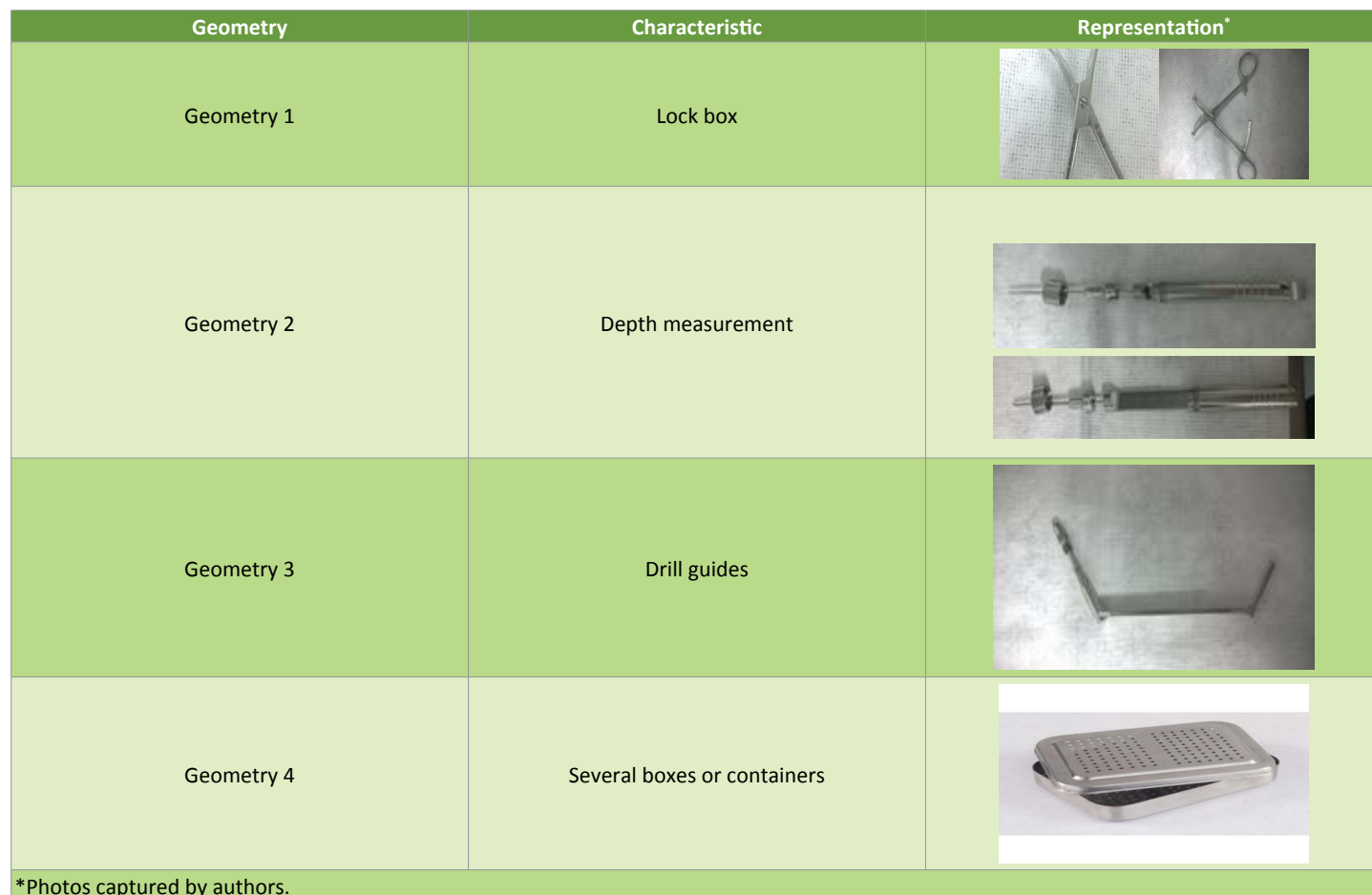
Table 3 Forms and clinical characteristics of the devices used.